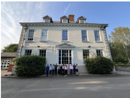
Camp St John's Saturday 5th July