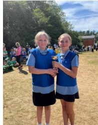
Ash and Oak House Captains