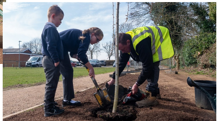
Eco Council in Action...