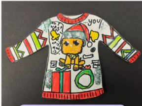
Jack (Melbourne) - Kingfishers