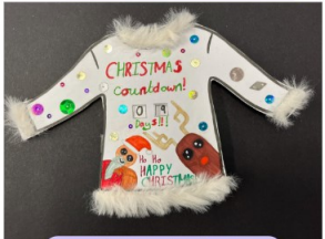
Emma (Cowper) - Sandpipers