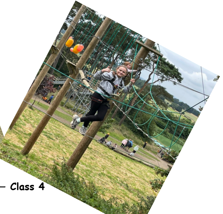
PGL 2024 — Class 4